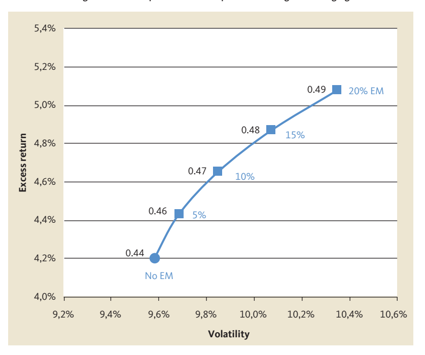
EXHIBIT 2: Strategic allocation to passive market capitalization weighted emerging markets

Sample period: January 1988 until December 2017. The Sharpe ratios of the portfolios are shown next to each data point in the graph.