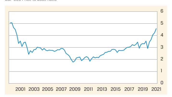
Figure 2 S&P 500 Price to Book Ratio